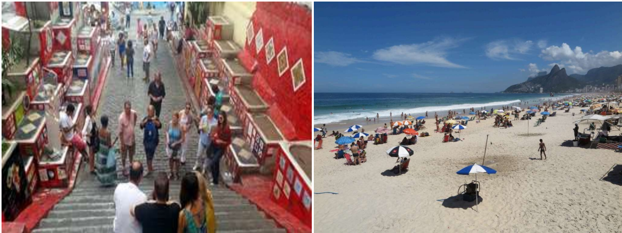
Selaron Steps / locals at Ipanema Beach

Day 19 Home. Arrive in Dubai 0030. Transit 3hr before flight EK346 to KUL departing at 330AM. Arrive home 2:35 PM FRI 21 FEB 2025