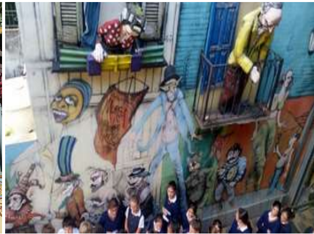
La Boca with its colourful murals & houses

Day 11 Fly Buenos Aires. Morning free & easy. Afternoon flight with about 2.5hr to the capital city of Buenos Aires. This cosmopolitan capital of Argentina feels more European than Latin America due to the many Italian immigrants who settled here. We stay in centrally located budget hotel with many surrounding restaurants and shops. Free rest of day to explore or join various free walking tours starting at 3pm. O/N Buenos Aires budget hotel for 3 nights.