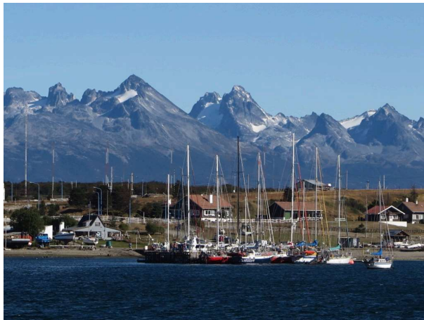
Colourful street art around Valparaiso / Land's end at Ushuaia

Day 6 El Calafate (Argentina). We take the morning public bus 6hr to El Calafate, located in Argentina Patagonia. El Calafate is the gateway to the Los Glaciares National Park. Short rest before our next late afternoon bus 3hr to El Chalten. O/N El Chalten with breakfast provided.