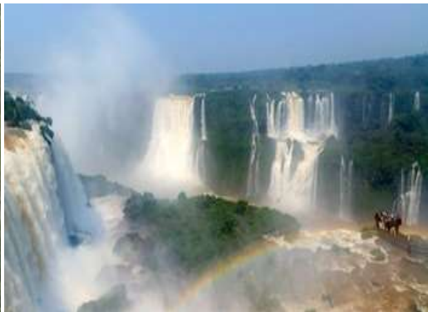
Iguazu Falls Argentina / Iguacu Falls Brazil

Day 14 Fly Puerto Iguazu Argentina. Early morning 2hr flight into Iguazu departing 630AM, arriving Iguazu airport 825AM. The entrance fo Iguazu National Park Argentina is 20 min from the airport. We use taxis to get there and store our baggage at lockers located at the entrance. Full day at Iguazu Falls to enjoy many scenic spots by walking and also short tram ride. Afternoon we travel by local bus to Puerto Iguazu, our overnight stay. O/N Puerto Iguazu. (Iguazu Park entrance ARS35,000, baggage lockers and all transport cost is covered).