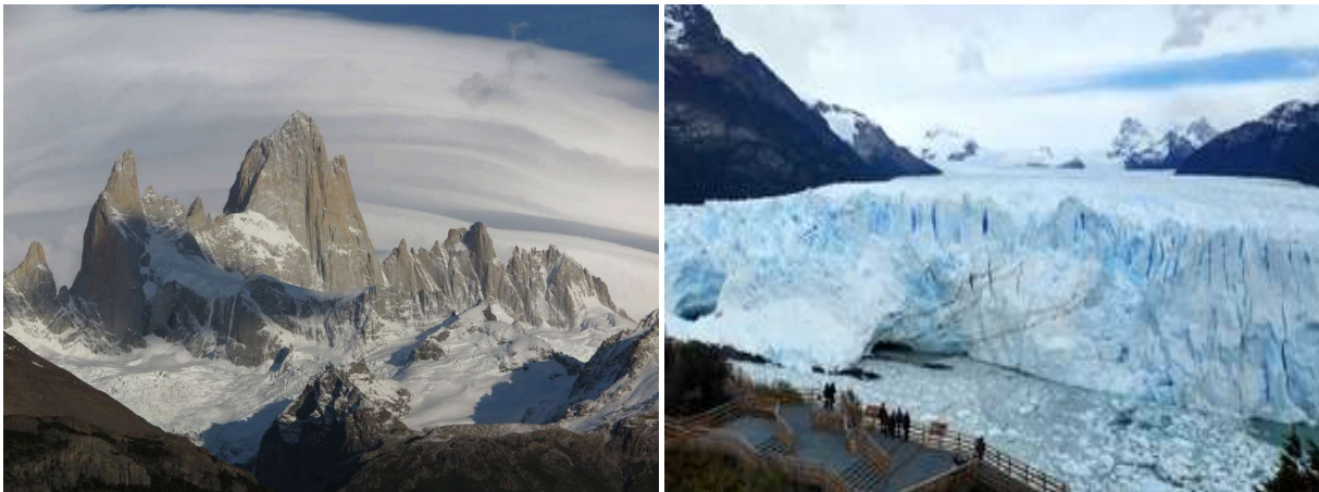
Mountainscape at El Chalten / Perito Moreno Glacier width 5km length 30km

IMPORTANT NOTICE: This is meant to be a "free and easy" adventure trip. Participants should be relatively fit, with a good sense of humor, and above all, have the right attitude for close travel with others through possibly some trying times. Most definitely, this is not a trip for prudes, whiners, fuss-pots, and other similarly assorted types! We had a couple of those before and it wasn't pleasant for us or them. Although every effort will be made to stick to the given itinerary, ground conditions may change and cause some disruption and/or deviation from the norm. Otherwise, have fun.